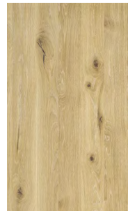
wild oak white oil*