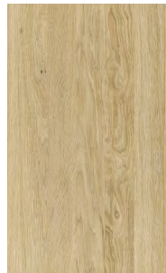
oak white oil