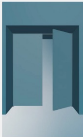
Hinged without basic door frame