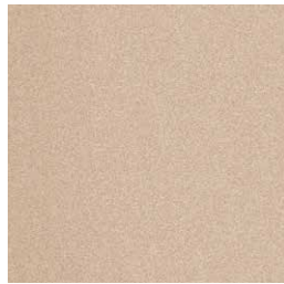
109 FT champagne fine textured