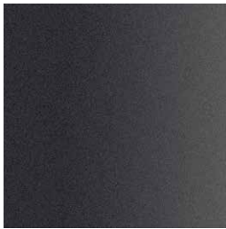
111 FT graphite fine textured