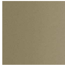
110 FT bronze fine textured