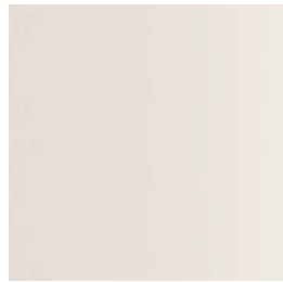
124 FT linen fine textured