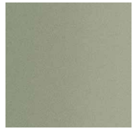
113 FT sage fine textured