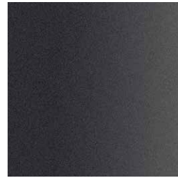
111 FT graphite fine textured