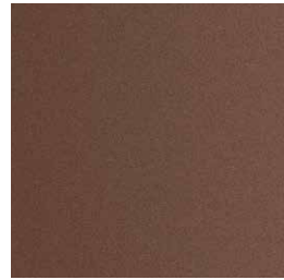
108 FT oxide fine textured