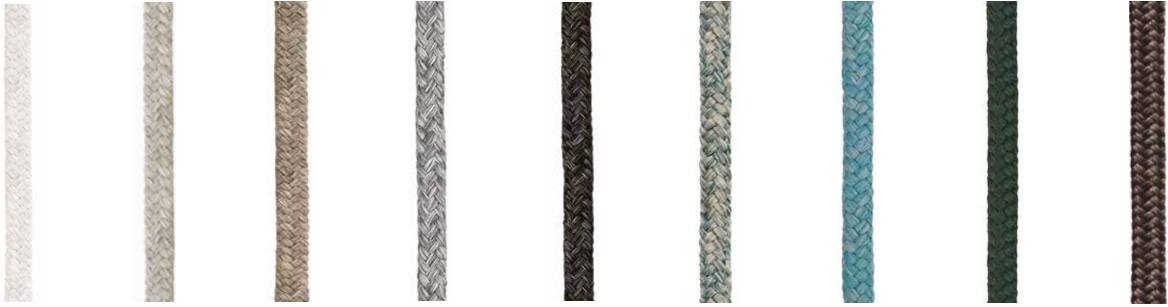
430 SPK white speckled